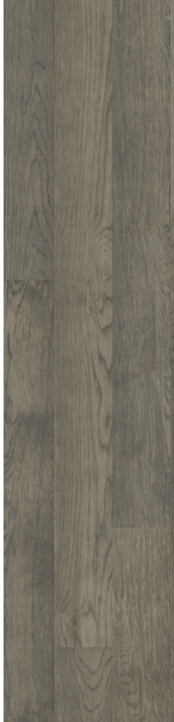
Slate Grey Oak Extra Matt AMT3846