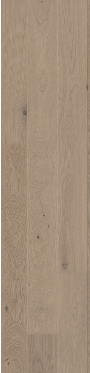
Cliff Grey Oak Extra Matt AMT3850