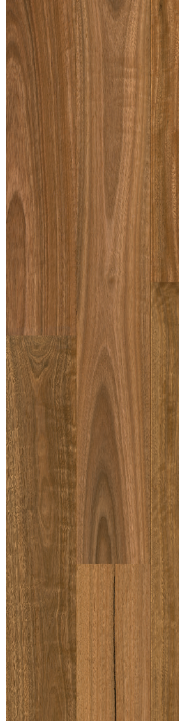
Spotted Gum AMT3859