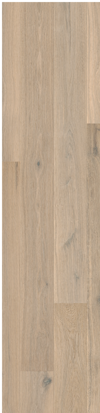
Creamy White Oak Extra Matt AMT3851