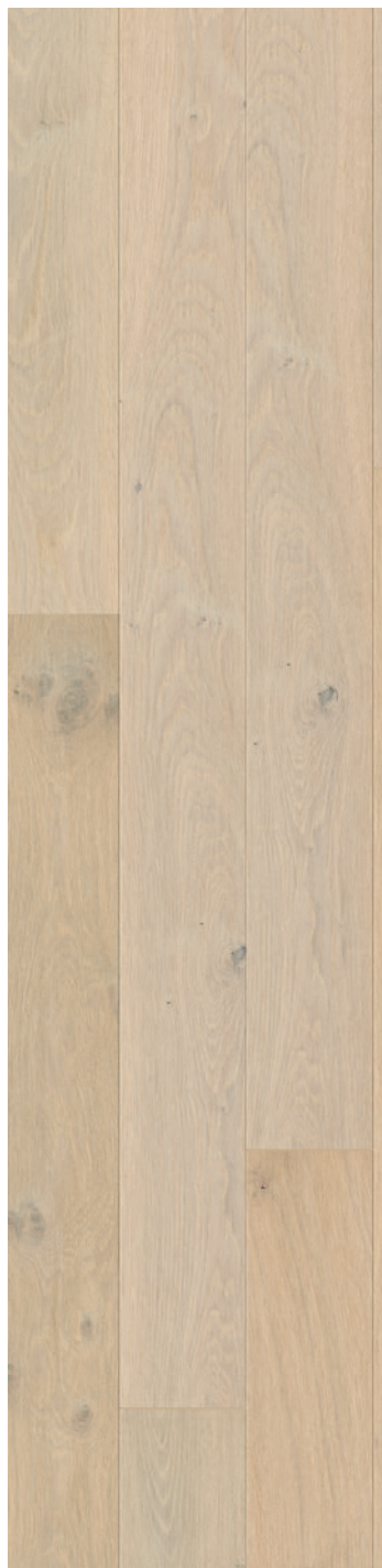
Wintry Forest Oak Extra Matt AMT3845

6 lengths = 1.463m 2 6 lengths = 1.914m 2