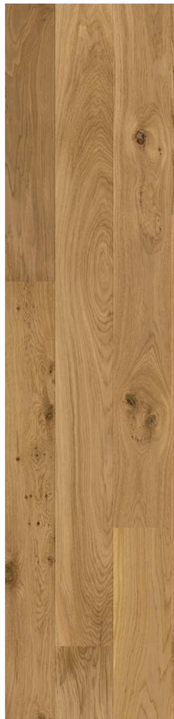
Natural Oak Extra Matt AMT3844