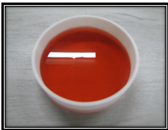
24 Hrs with Water