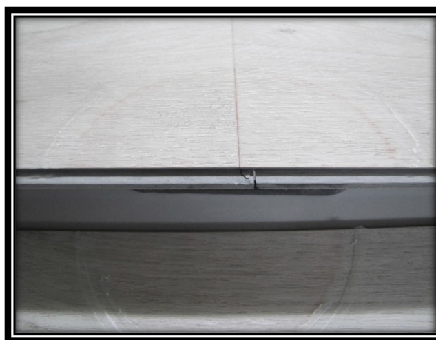
Recovered Swell (Disassembled)

Samples and their identifying descriptions have been provided by the client unless otherwise stated. NZWTA Ltd makes no warranty, implied or otherwise as to the source of the tested samples. The above results are designed to provide THE CLIENT WITH GUIDANCE INFORMATION ONLY. This document shall not be reproduced except in full.