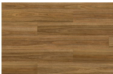
Stonewashed Spotted Gum TIC170