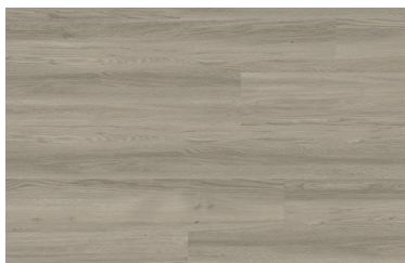
Silver Grey Ash TIC174