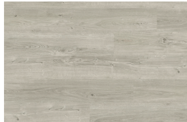
Alpine Grey Ash

A classic range with a small, narrow format. A range of carefully chosen designs, rigorously tested for durability, will stay beautiful for years to come.