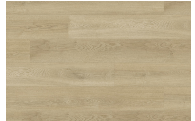
Snow Gum Oak