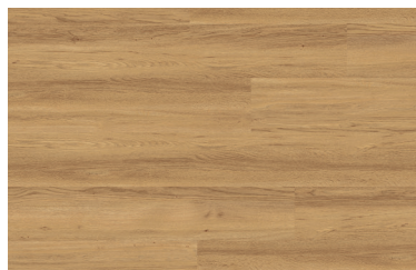
Seasoned Prime Oak TIC173