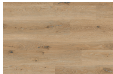
Country Oak TID039