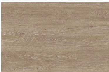
Classic Oak Light Beige TID001

Titan Vinyl Glue planks are a cost effective option, when you don't want to compromise on the look and durability of your floor. With 8 fashionable designs there's a Titan Vinyl Glue decor to suit every room in your home.