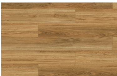
Bleached Blackbutt TIC171