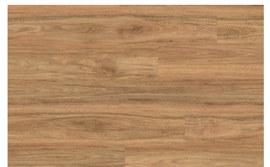
Stonewashed Spotted Gum