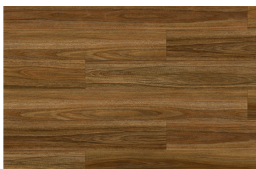
Spotted Gum TIC169