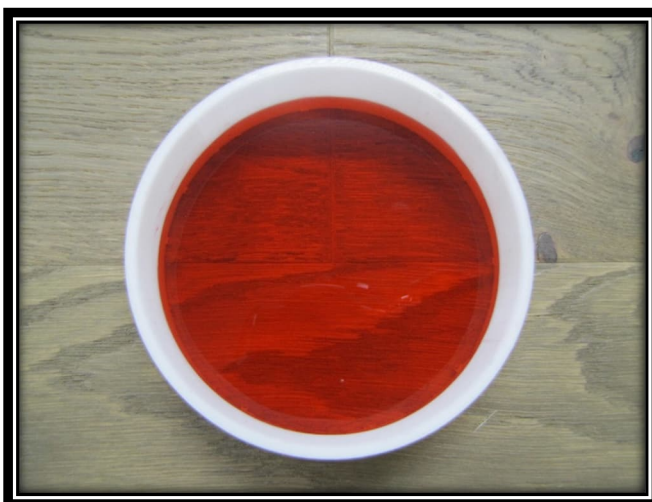
24 hrs With Water