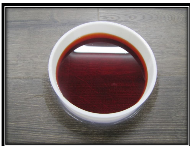
24 Hrs with Water