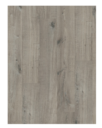
COTTON OAK GREY WITH SAW CUTS