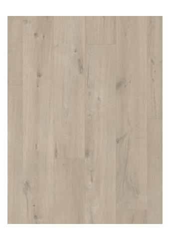
COTTON OAK BEIGE