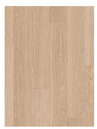
PURE OAK BLUSH