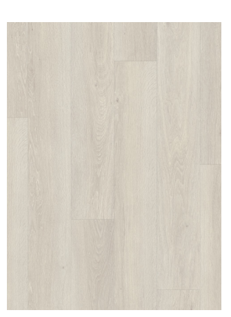
SEA BREEZE OAK LIGHT