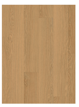
PURE OAK HONEY