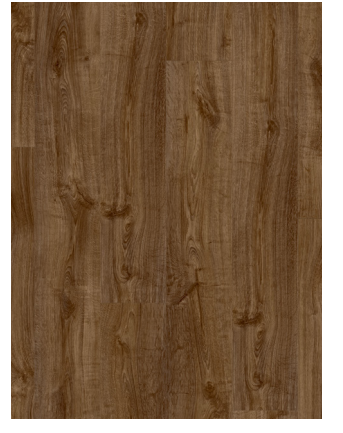
AUTUMN OAK BROWN