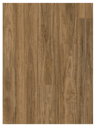
WILD SPOTTED GUM