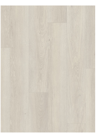
SEA BREEZE OAK LIGHT