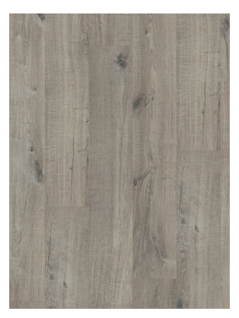
COTTON OAK GREY WITH SAW CUTS