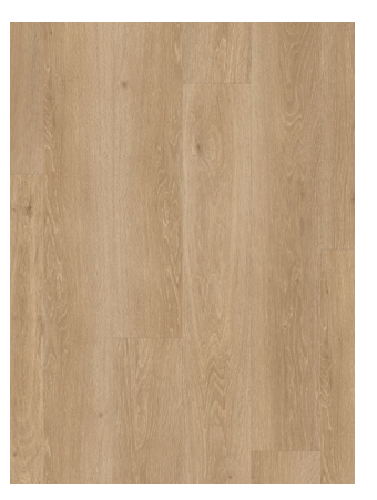
SEA BREEZE OAK NATURAL