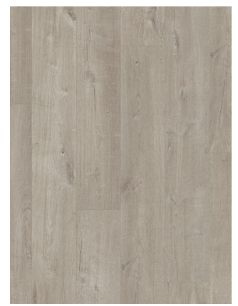
COTTON OAK WARM GREY