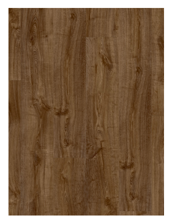
AUTUMN OAK BROWN