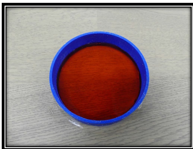
After 24 hrs With Water