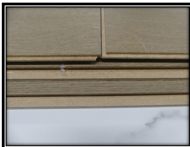
Recovered Swell (Disassembled)

Samples and their identifying descriptions have been provided by the client unless otherwise stated. NZWTA Ltd makes no warranty, implied or otherwise as to the source of the tested samples. The above results are designed to provide THE CLIENT WITH GUIDANCE INFORMATION ONLY. This document shall not be reproduced except in full.