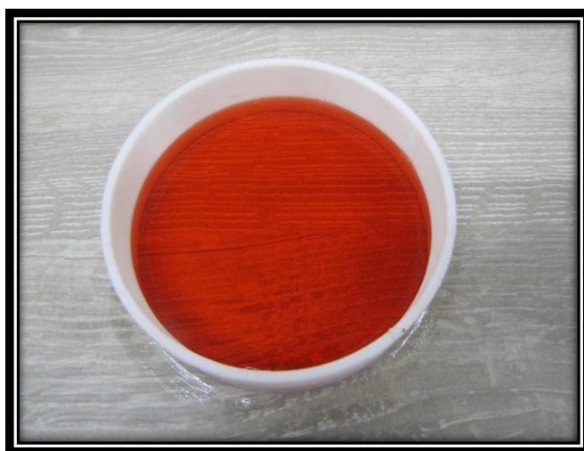
24 hrs With Water