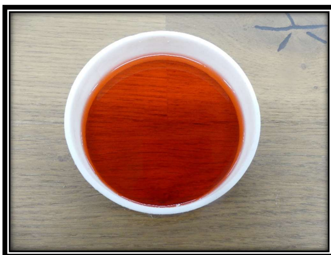
After 24 hrs With Water