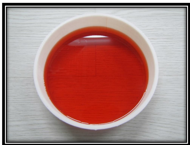
24 Hrs with Water