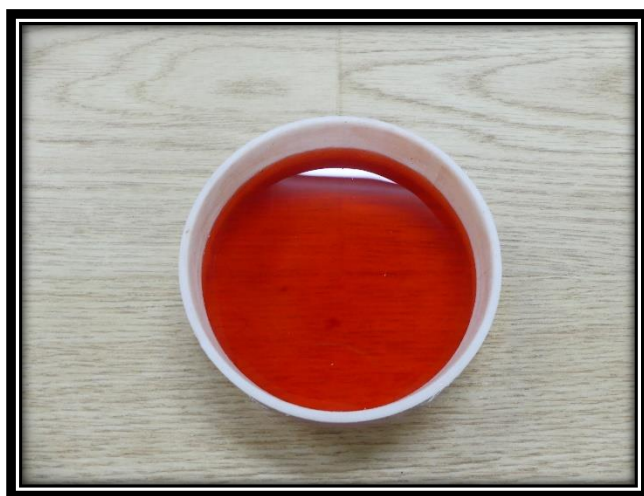
After 24 hrs With Water