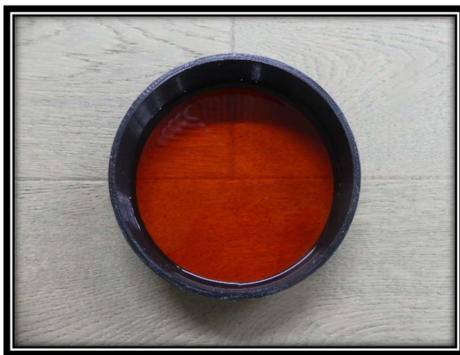
After 24 hrs With Water