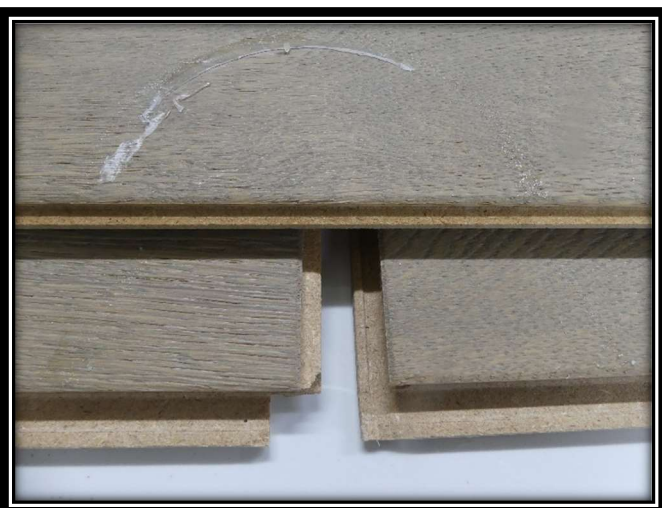
Recovered Swell (Disassembled)

Samples and their identifying descriptions have been provided by the client unless otherwise stated. NZWTA Ltd makes no warranty, implied or otherwise as to the source of the tested samples. The above results are designed to provide THE CLIENT WITH GUIDANCE INFORMATION ONLY. This document shall not be reproduced except in full.