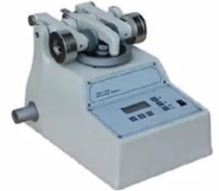
Taber test machine

Plus Uniclic joining systems used ensure that boards fit tightly and will not gap like tongue & groove flooring does.